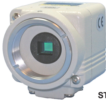
STC-N63/P63 Image shown not actual size

In a very compact housing, the STC-N63/P63 cameras employ a high resolution, 1/3" color CCD that produces 480 TV Lines of horizontal resolution. The STC-N63/P63 series cameras are available in cased (with the option of four back panels - BJ, BT, CJ, or CT) and board level.