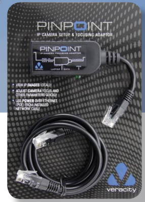
PINPOINT pack comes complete with patch cable.

Veracity's PINPOINT adaptor allows IP video installers to easily set up and focus Power over Ethernet (POE) enabled cameras. No temporary local power source for the camera is required, as PINPOINT enables the camera to draw its power from the installed POE network cabling, whilst re-directing the actual Ethernet network connection to a local laptop, netbook or even PDA.