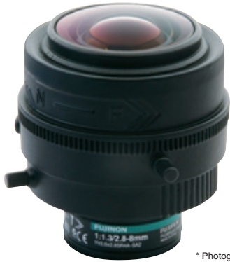
* Photograph is a similar model.

2.7x Applicable camera (model) 1 2/3 1/2 1/3 1/4 For Security