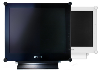
Available in black or white