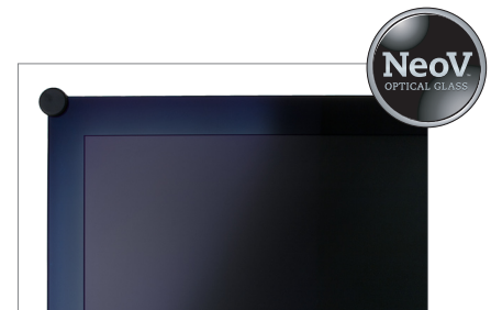
NeoV™ Optical Glass and durable metal casing for water, dust and scratch resistance