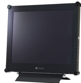
Front-panel keypad with Input Select, Screen Menu, Contrast and Brightness controls for quick adjustments