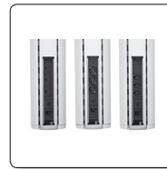
Electrical power sockets can be mounted at the rear.