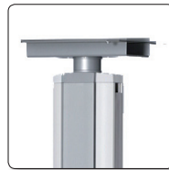
Rotatable, discrete, secure attachment.