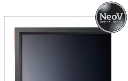
NeoV™ Optical Glass protects against scratches, impacts and other physical damage