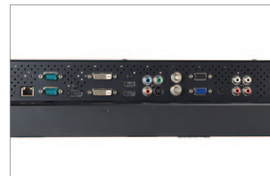
Multiple video inputs (VGA, DVI, HDMI, BNC, S-Video, DisplayPort and Component) allow for effortless system integration