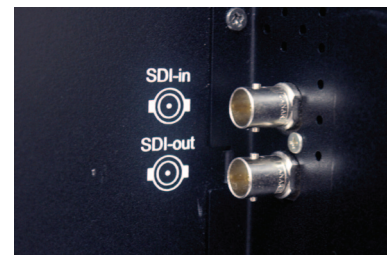
SDI inputs bring forth mega-pixel images without interruption or delay