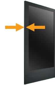
Durable metal casing with 23.4mm slim profile