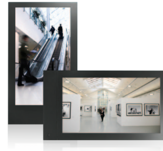
Flexible orientation: portrait/ landscape