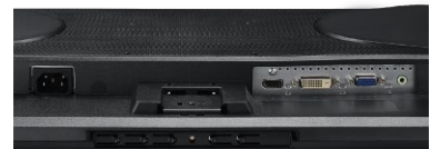
Built-in HDMI input makes the LE-24 easy to be paired with Full HD multimedia advices