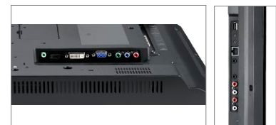
Versatile connectivity: VGA, DVI, HDMI, Composite, Component