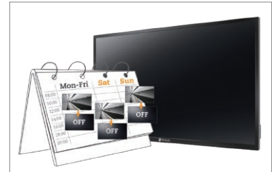
Built-in scheduler automatically activates and deactivates the PM-32 with designated input signal according to programmed schedules