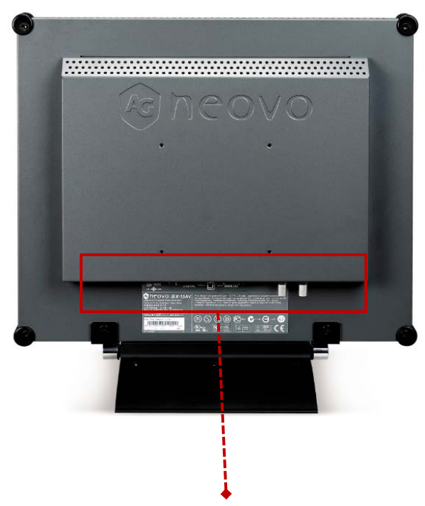
SX-15 : Ports only on the bottom

Back Cover – Same Dimension; Different Connectivity Layout