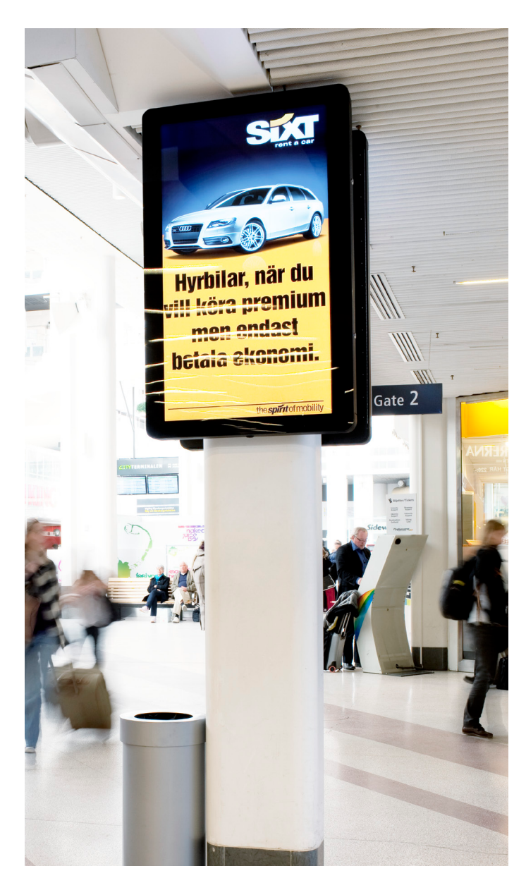
The product is highly visible at a distance yet blends well in with both modern and classical, more sensitive, surroundings.