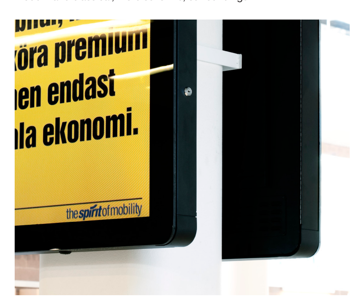
Simple installation that gives a gracile impression, even when used for double-mounted displays.