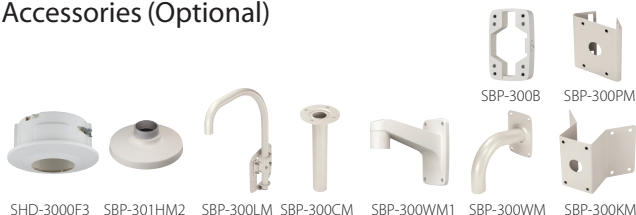
SHD-3000F3 SBP-301HM2 SBP-300LM SBP-300CM SBP-300WM1 SBP-300WM SBP-300KM