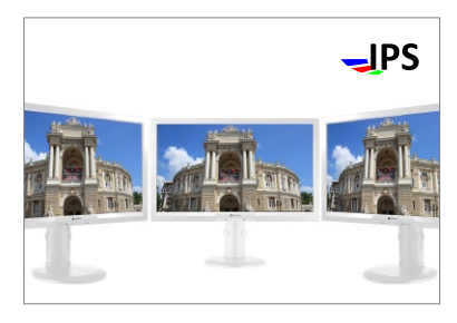
IPS panel provides superb clarity from all angles