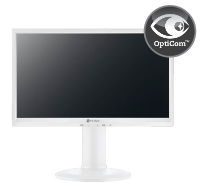
Advanced\ OptiCom^{\rm TM}\ Technology:\ Anti-blue\ light\ and\ flicker\ free\ for\ a\ more\ comfortable\ viewing\ experience