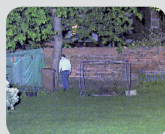
White-Light on External