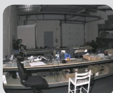
White-Light on Internal