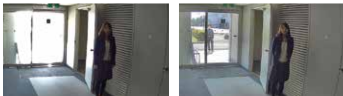
OFF ON Actual Images

* The image on the right is produced with the camera's Defog Image Processing feature, after the camera shot this application photo as its subject.