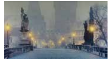
OFF ON Actual Images*

* The image on the right is produced with the camera's Defog Image Processing feature, after the camera shot this application photo as its subject.