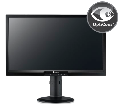
Advanced OptiCom™ Technology: Anti-blue light and flicker free for a more comfortable viewing experience