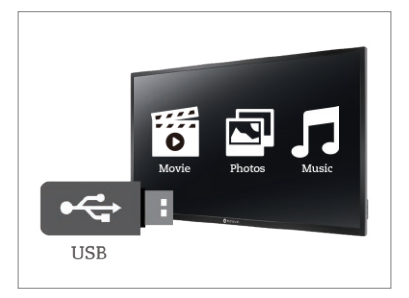
USB Playback for easy multimedia content presenting