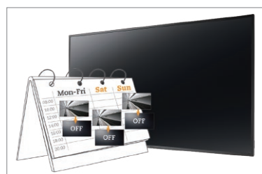
Built-in scheduler automatically activates and deactivates the PM-55 with designated input signal according to programmed schedules