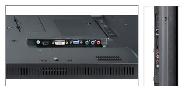
Versatile connectivity: VGA, DVI, HDMI, Composite, Component