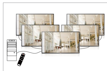
RS-232/ RJ45/IR for remote control