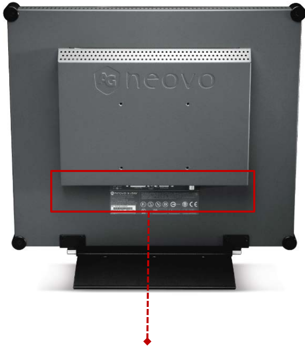
X-15: Ports only on the bottom

Back Cover – Same Dimension; Different Connectivity Layout