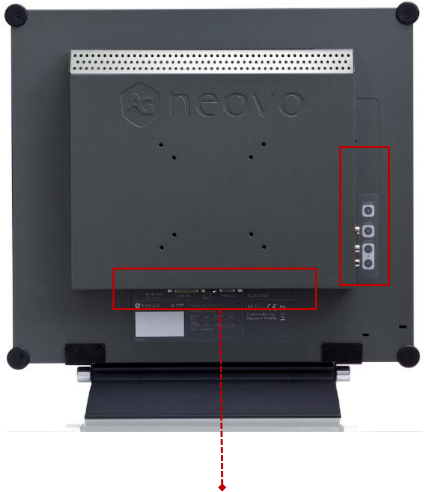
X-15P: Ports on the bottom and side