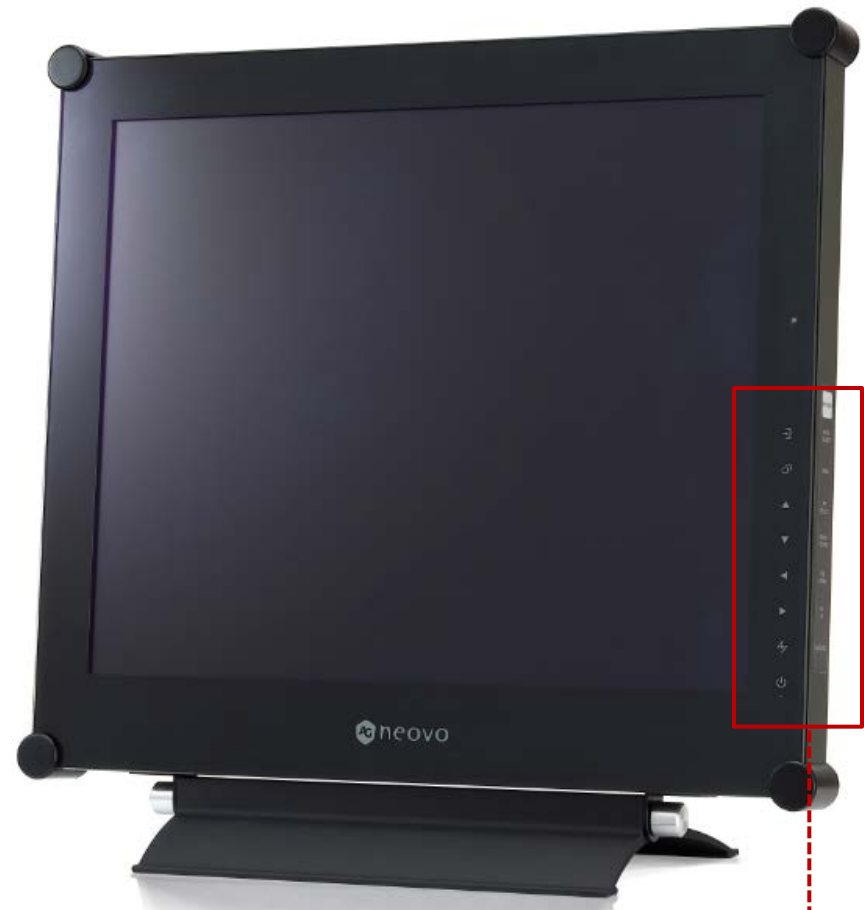
X-15: Physical buttons