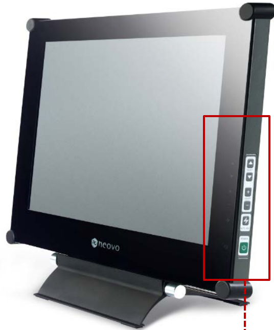
SX-15: Physical buttons ←

Updated Buttons – Locations and Touch Function