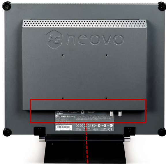
SX-15: Ports only on the bottom

Back Cover – Same Dimension; Different Connectivity Layout