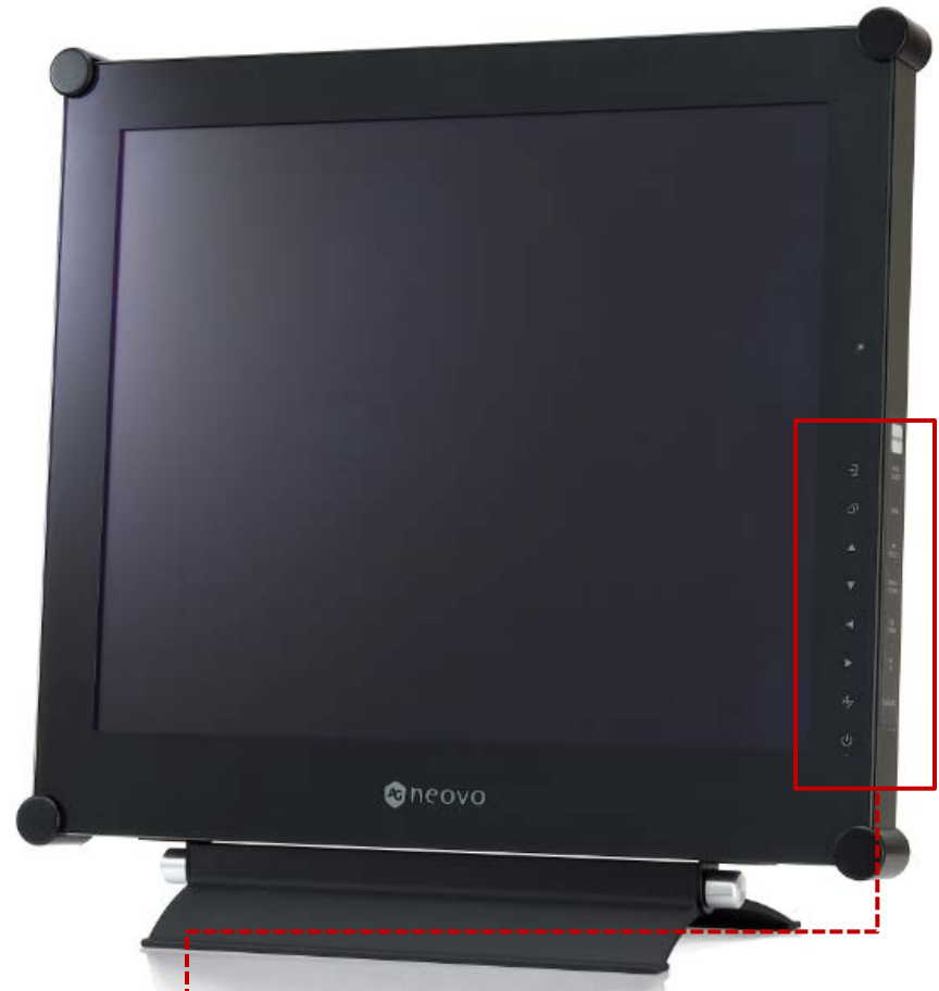
→ SX-15P: Touch sensor buttons