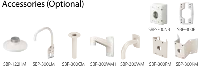
SBP-122HM SBP-300LM SBP-300CM SBP-300WM1 SBP-300WM SBP-300PM SBP-300KM