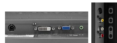
Wide range of I/O connectors for flexibility and expandability in video installations