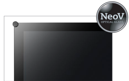
NeoV™ Optical Glass and durable metal casing for water, dust and scratch resistance