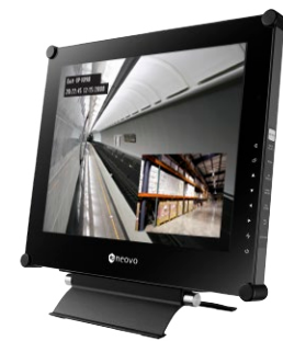
Flexible image viewing options such as PIP/PBP, freeze, 180° image rotation