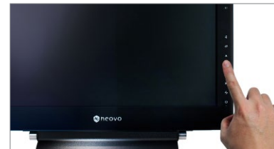
Front-panel keypad with Input Select, Screen Menu, Contrast and Brightness controls for quick adjustments