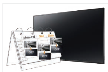
Built-in scheduler automatically activates and deactivates the PM-48 with designated input signal according to programmed schedules.