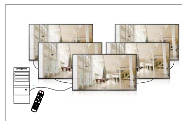
IR for remote control