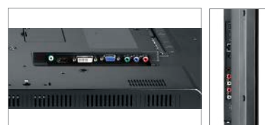
Versatile connectivity: VGA, DVI, HDMI, Composite, Component