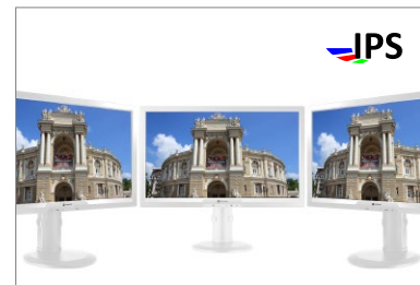
IPS panel provides superb clarity from all angles