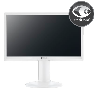
Advanced OptiCom™ Technology: Anti-blue light and flicker free for a more comfortable viewing experience