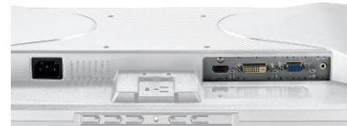
Built-in HDMI input makes the LE-22 easy to be paired with Full HD multimedia advices