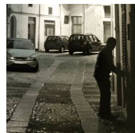
AG Neovo SX-Series