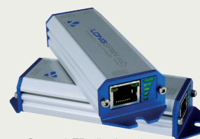
Smart LED display shows SAFEVIEW™ technology.

separate POE injector may be used as the Base power source. Maximum power and range is achieved with the optional 57V Veracity PSU, enabling the LONGSPAN Base unit to become the POE injector for the link.