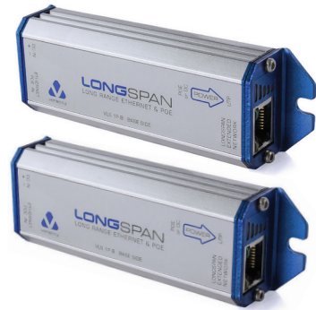
LONGSPAN BASE and CAMERA are sold separately.

LONGSPAN delivers unrestricted 100Base-T with 802.3af and 802.3at POE at distances far beyond the normal Ethernet limits for problem free IP camera installation