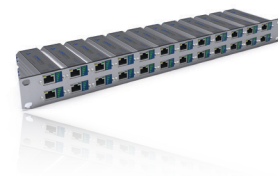
Up to 24 LONGSPAN units can be mounted in a 1U rack space. Ask for VLS-1U

Distances may be increased by connecting multiple links in series. Data rate at full range stated : 100Base-T = 200Mbps, 10Base-T = 20Mbps