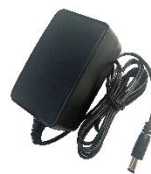
MSA-C1500IC12.0-18P-US MSA-C1500IC12.0-18P-GB MSA-C1500IC12.0-18P-JP Power adapter