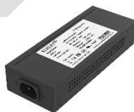
LAS60-57CN-RJ45 Hi-PoE midspan