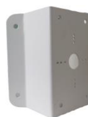
DS-1276ZJ-SUS Corner Mount