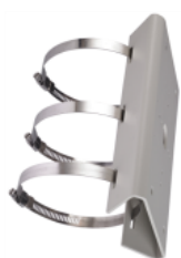
DS-1275ZJ-SUS Vertical Pole Mount