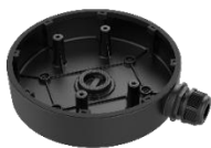
DS-1280ZJ-DM55(Black) Junction Box